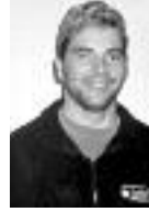
Curt Oshkosh Customer Service & Delivery