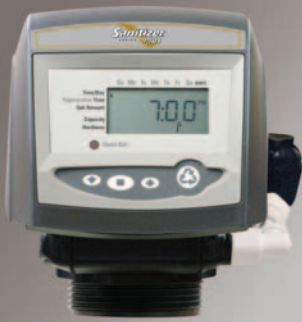
The Sanitizer Plus system's LCD readout displays large, easy-to-read numerals and icon graphics.